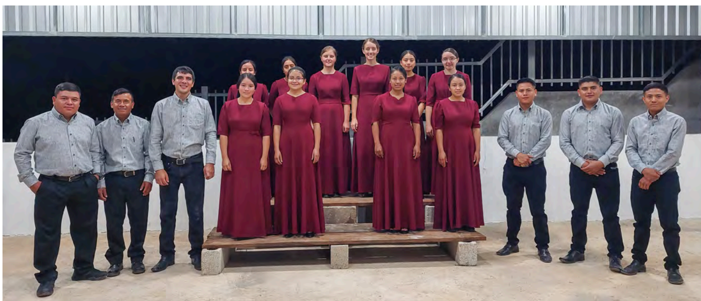
The Messengers of Mercy chorus is from the Mixcolajá congregation.